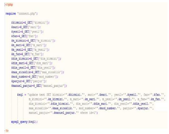
Figure 8. PHP codes used to print data into a MySQL database

The PHP codes are used to read the data which is sent to the database by the android application by the microcontroller. The microcontroller connects to the Internet at regular intervals to run the file containing these PHP codes. PHP codes print data on the screen. These data are read by the microcontroller and the relevant devices are checked.