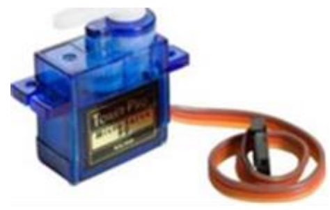
Figure 2. Servo-motor

Servo motor is used for shutter control. This motor can rotate between 0 and 180 degrees with a precision of 1 degree. The shutter control is automatically switched on and off both manually and depending on daylight.