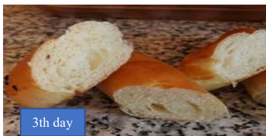
Figure 3: Appearance of PA bread