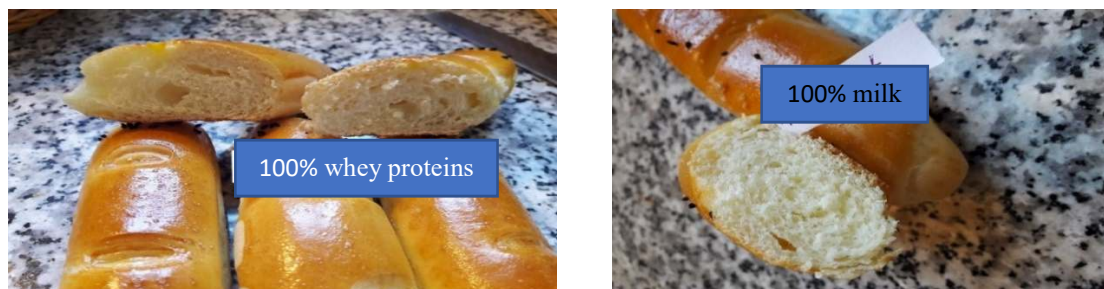
Figure 2: Appearance of bread crumbs with whey and milk (PA and PB)