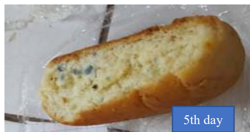
Figure 4: PB Bread with mold (rancid)