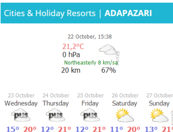
Figure 2. The input rainfall information

As seen in Fig. 1, generally trapezoid and triangle membership functions are used in the model.